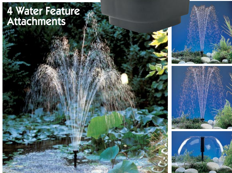
4 Water Feature Attachments

LIFEGARD AQUATICS Aquarium, Pond & Aquaculture Products