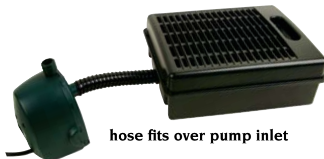
hose fits over pump inlet