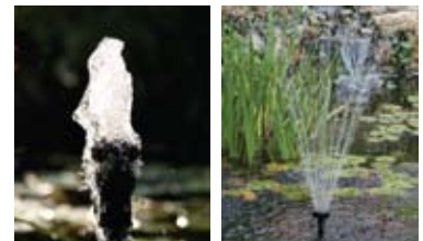
Fountain heads create 3 different patterns (included with FK3 & FK5 kits)